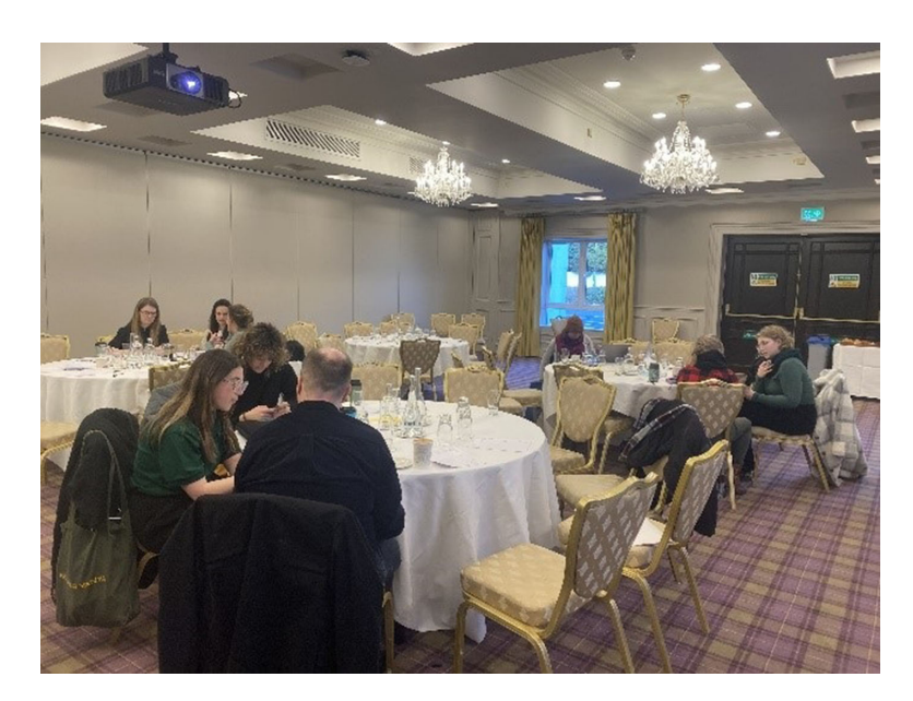
Figure 1. In person workshop with NbS experts organized in Maynooth, Ireland (February 2023).

with ethics and equity because it impacts people differently, unevenly, and disproportionately (Shue, 2014; Gaillard et al., 2017; Sultana, 2022). Social inequalities tend to co-exist with harmful environmental conditions and disproportional suffering from possible effects of climate change, resulting in greater subsequent inequality and a limited ability to cope and recover (Islam and Winkel, 2017; Barboza et al., 2023). Hence, a climate justice approach is essential because such an approach focuses on who benefits, who is harmed, in what ways privileges and losses are conferred, as well as where and why. Thus, it is also essential to recognize that climate change involves a common but differentiated responsibility. The aforementioned understanding necessitates justice to be a central entry point for this GID framework.